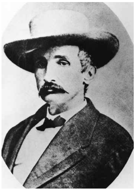
Benjamin Ficklin, VMI Class of 1849, was one of the co-founders of the Pony Express.

Currently, the Archives' home on the 4<sup>th</sup> floor of Preston Library is still under construction as the library undergoes its first renovation in nearly 25 years. Sometime this month, the Archives is