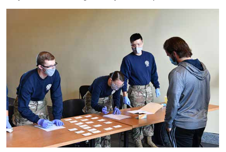
Cadets EMTs check in a prospective cadet during the first admissions open house Oct. 3.

Corps. Some take walking tours of post, but they are not allowed to