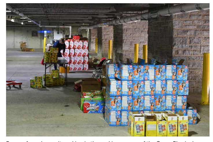
Boxes of snacks await packing in the parking garage of the Corps Physical Training Facility.