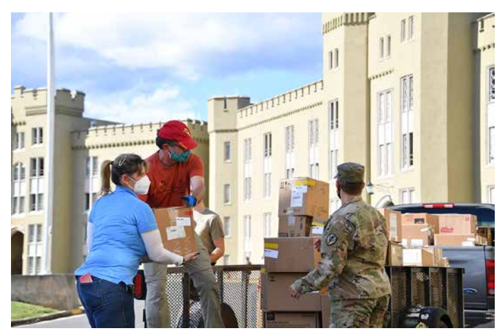
Parents and members of the cadet S7 staff unload care packages outside barracks.

"A lot of things got canceled for these [cadets], particularly for the rats," she commented. "We want to keep the spirit of VMI going." *