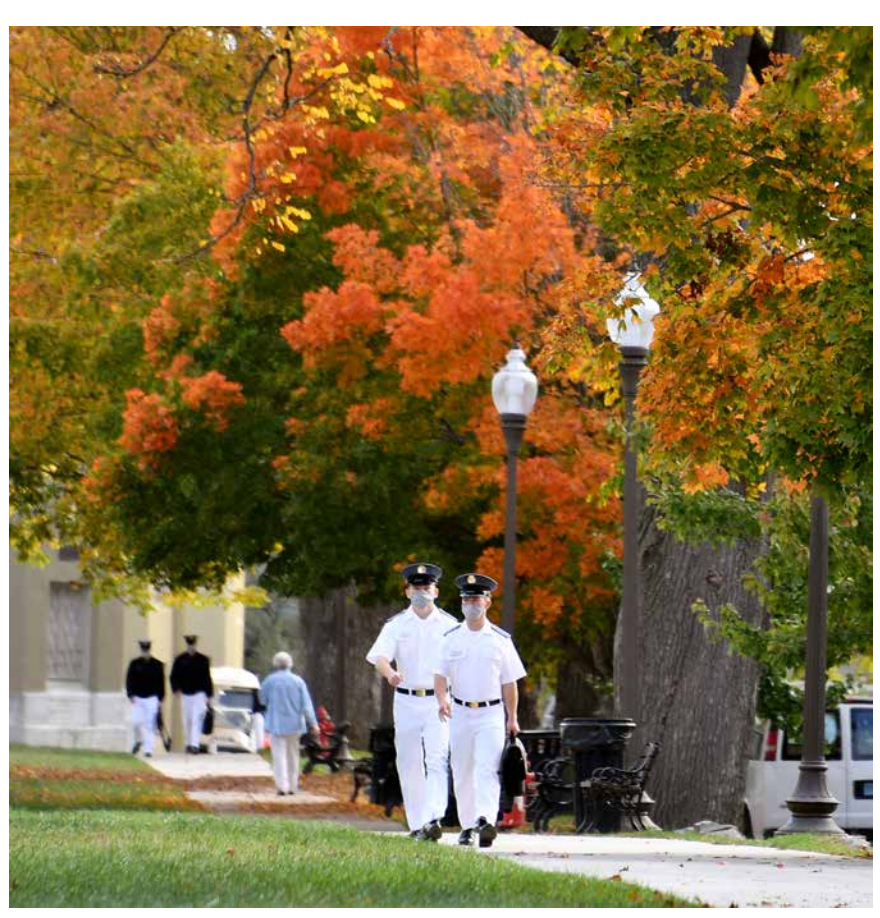
Cadets walk to class while wearing masks earlier this fall.

Additional information regarding cadet departure, the Class of 2022 Ring Figure, December commencement, cadet return, and support services for all of these events and activities, as well as details regarding refunds for fall room, board, and fees will be available at vmi.edu/fall-2020. **