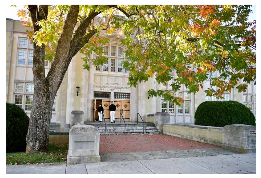
Mallory Hall, home to VMI's Department of Computer and Information Sciences, will soon house VMI's cyber defense lab.

The agreement, which will bring $1.45 million to VMI in the first year of funding, establishes VMI as a participant in the DoD Senior Military Colleges (SMC) Cyber Leadership Development Program.