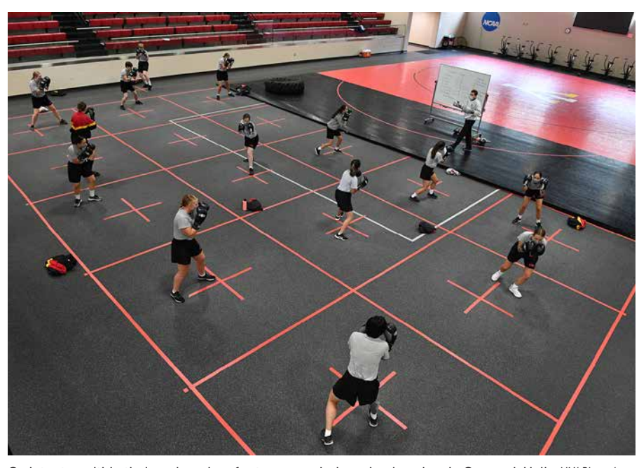
Cadets stay within their assigned 10-foot squares during a boxing class in Cormack Hall.

As the semester has progressed, Coale has observed that cadets have more fluid, natural