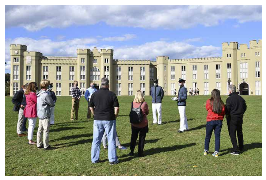
Cadets talk with prospective cadets and their parents during the Oct. 3 admissions open house.