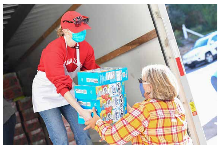
Mothers of cadets unload fruit snacks and other treats for care packages outside the Corps Physical Training Facility Oct. 3.