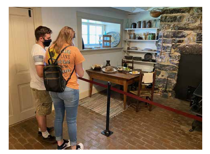
Visitors progress through a self-guided tour at the Stonewall Jackson House in early October.

The Stonewall Jackson House is open Thursdays through Mondays from 9 a.m. to 5 p.m. through the rest of this year. The house is closed on Tuesdays and Wednesdays.