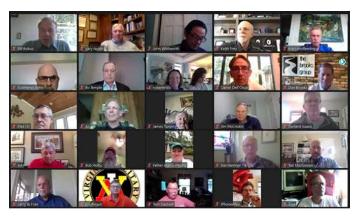
More than 90 brother rats from the Class of 1975 met via Zoom to celebrate their 45^{\rm th} reunion Sept. 19.

"We're going to do some stewardship on them to promote them as volunteers, giving time or talent," said Brashears.