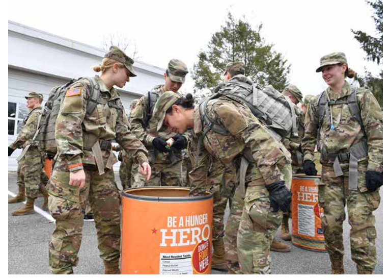
Rats march donated food to the Rockbridge Area Relief Association food pantry in January for the annual Rat Unity event. VMI takes the No. 1 spot for promotion of public service in Washington Monthly's college rankings.

VMI's engineering program was ranked 29<sup>th</sup> out of 220 schools nationwide that have an accredited engineering program but do not grant a doctoral degree.