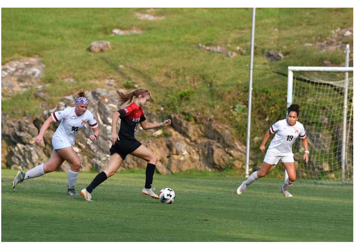
Members of the women's soccer team participate in a scrimmage Sept. 18.

On a personal level, Quispe has chosen to let go of what he can't control.