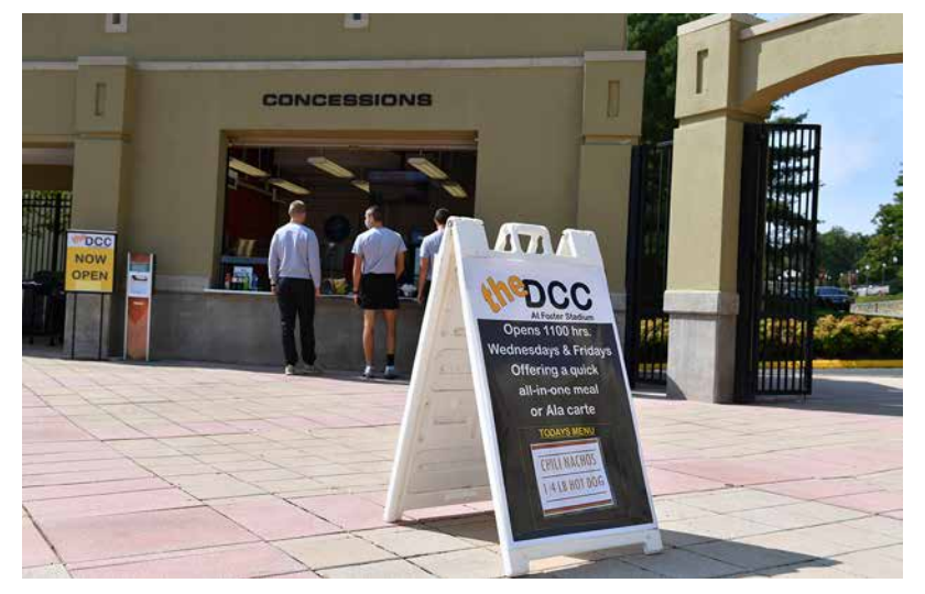
Cadets select toppings for their nachos at Foster Stadium on Sept. 23.