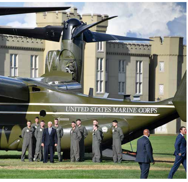
spreys pose with Pence just before taking off Sept. 10.

"If you develop and maintain those virtues ... you will lead lives of consequence and distinction," he stated. "America needs leaders like the ones from VMI to lead this nation forward."