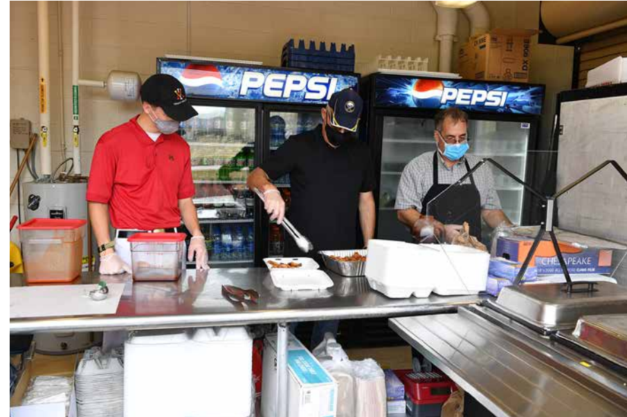
Parkhurst Dining employees prepare chicken wings in a concession stand of Foster Stadium to sell to cadets for an on-the-go option.

In Crozet Hall. in addition to three separate formations for breakfast roll call (BRC) and supper roll call (SRC), there's been the addition of a grab-and-go lunch option in the Sub's Mess, which is located on the side