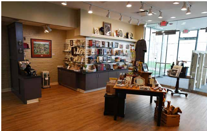
The new gift shop area for the Stonewall Jackson House will be ready for visitors once non-essential businesses are allowed to open again.

While not technically a VMI museum, the George C. Marshall Museum and Library located on VMI's post is also temporarily closed. 🦋