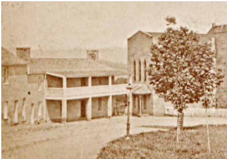
The old hospital—seen here in 1890—was built after an outbreak of typhoid fever in barracks in 1845.

Just six years after the founding of VMI, in 1845, a typhoid fever epidemic struck Lexington and the Institute. The cadets were quarantined to post. This health emergency resulted in the building of the VMI Hospital in 1848-49. The hospital could