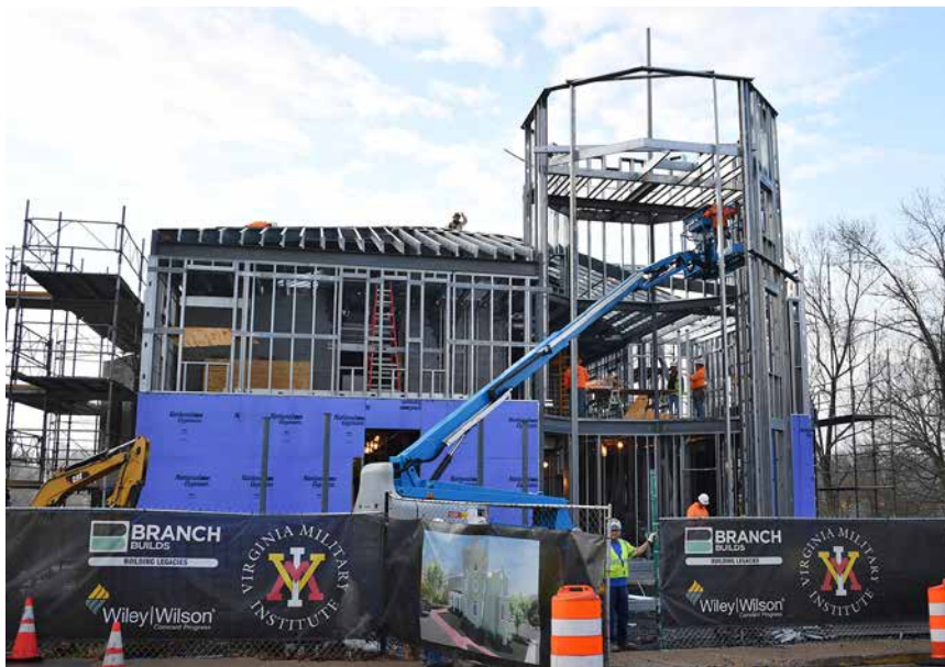
Crew members of Wiley-Wilson continue work on the post police headquarters on Letcher Avenue—VMI Photo by Kelly Nye.

Contractors, though, have been taking extra precautions on their job sites. The contractors have set up hand sanitizing stations, and they're wiping down commonly used surfaces such as handrails and tools that are used by multiple workers. Workers