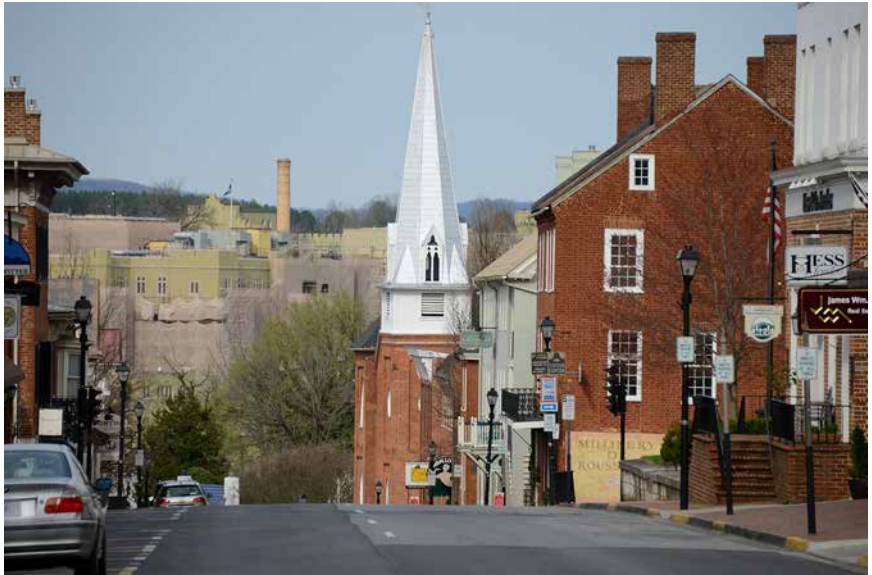
Downtown Lexington sits mostly empty of cars and people after Gov. Ralph Northam '81 ordered non-essential businesses to close on March 24.

Restaurants, she noted, operate on thin margins in the best of times, and business this spring has been grim. The Palms, a Lexington fixture since 1975, has temporarily closed, and many of the other spots popular with cadets, such as Pure Eats and Macado's, are doing the best they can to hold on via a carryout menu. The Southern Inn, with its classic neon sign marking its place on the