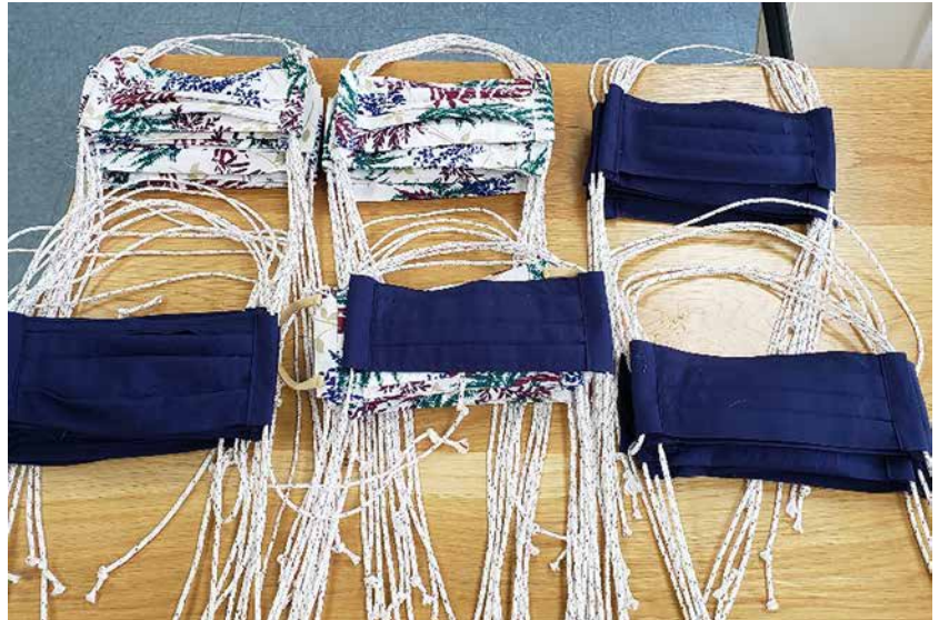
More than 500 masks have been made for the VMI community by the employees of the tailor shop.