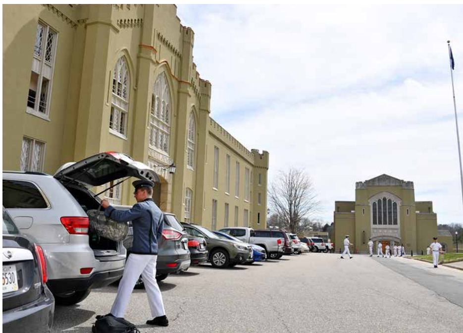
Cadets pack their belongings for spring furlough March 12, not knowing this would be the last time they would be on post together for the semester.