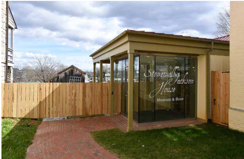
The Stonewall Jackson House briefly opened its new gift shop area in the Davidson Tucker House before having to close.