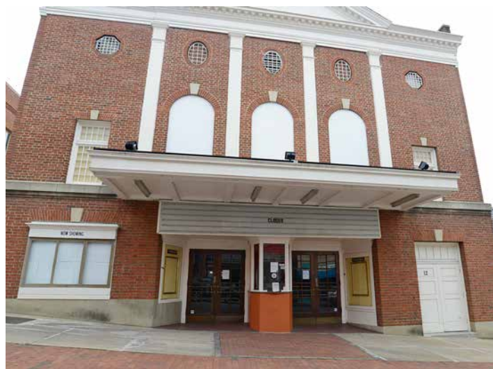
The State Theatre, and many businesses in Lexington, remain closed.