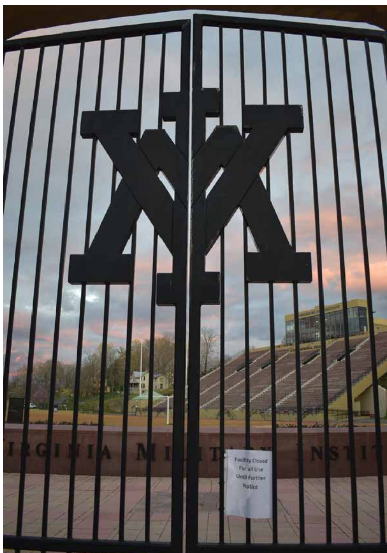
Foster Stadium, along with all facilities on post, is closed to the public for the time being.

While formal practices aren't permitted, cadet-athletes are encouraged to continue their individual training. Baseball players have daily workout