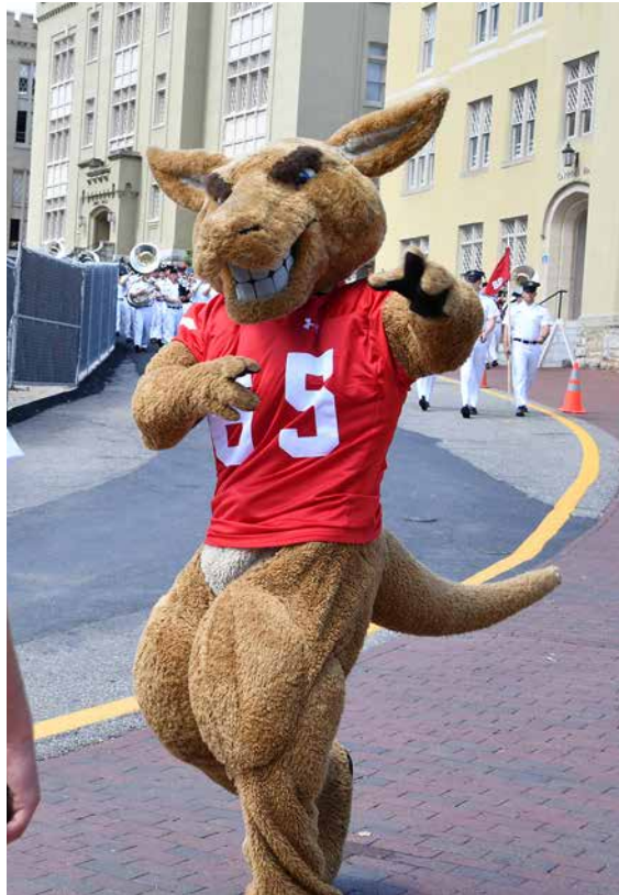
Moe was named the Southern Conference's most popular mascot.

"At the end of the day, we will continue to do the right thing by the players and program, and will work earnestly to continue to