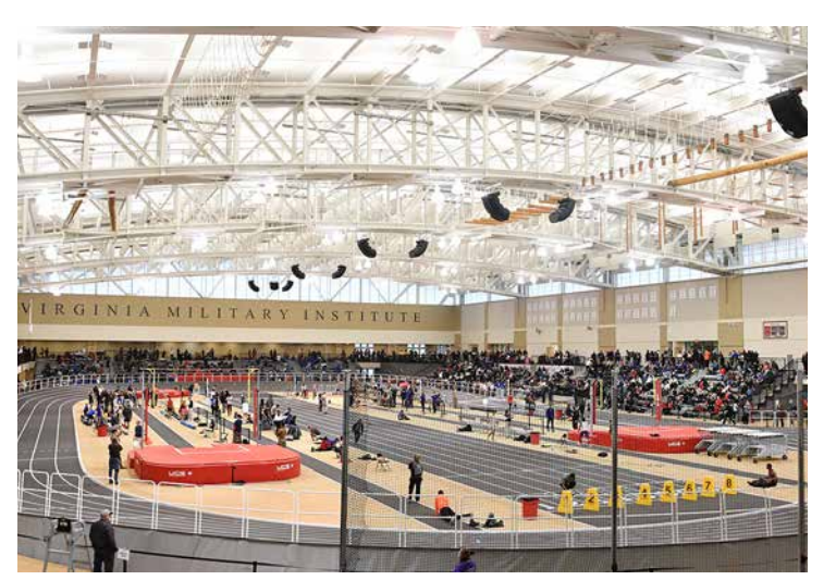
More than 25 schools from the Mid-Atlantic region compete in the Corps Physical Training Facility during the Keydet Invitational Jan. 18.