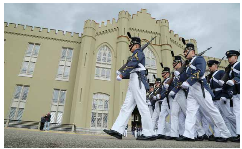
Cadets march in a parade earlier this academic year.

million—is equal to the amount that an endowment valued at about $65 million would generate. Some have called annual giving, therefore, a 'living endowment,' and they're entirely correct." *