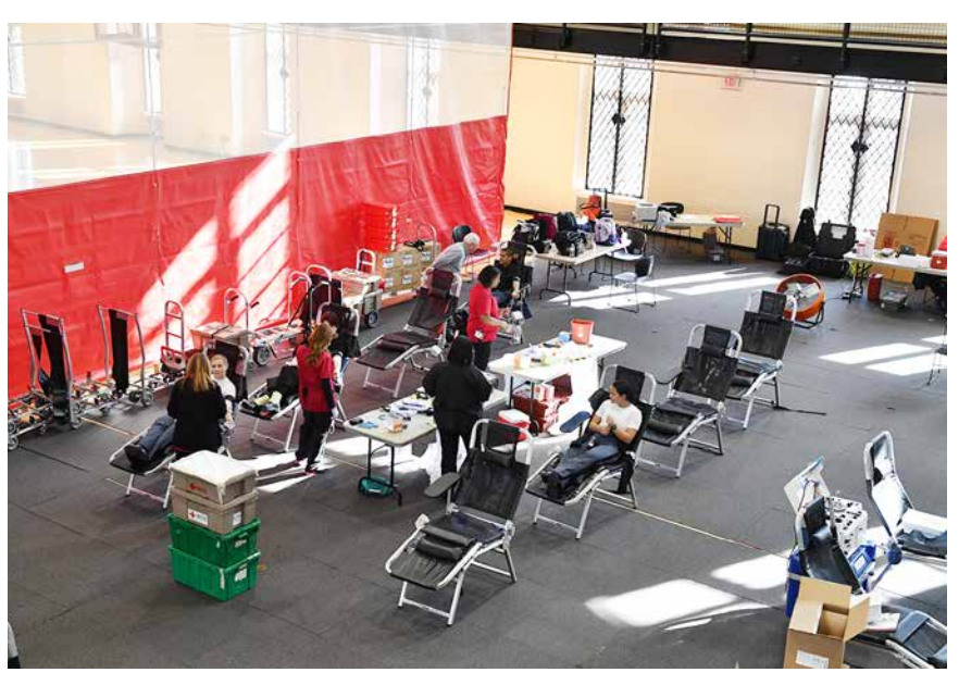
Cadets give blood in Cocke Hall during a December blood drive.

The economists also found that younger cadets donate more often than older ones. This finding can likely be explained by the VMI system of class privileges, they noted. As cadets advance into the 2<sup>nd</sup> and 1<sup>st</sup> Class years,