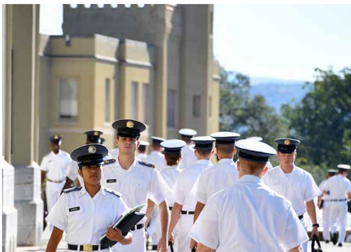
Cadets make their way to class Aug. 29.

Washington Monthly also ranked VMI quite highly, placing the Institute 22 nd nationwide among liberal arts colleges. It's the Institute's highest placement ever by Washington Monthly , and a substantial jump from last year's ranking of 39 th . The only Virginia