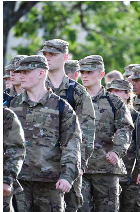
Rats march up Letcher Avenue after Rat Crucible in 2018 (left) wearing ACUs, and in 2019 (right) wearing OCPs.

money that covered two sets of OCPs for all cadets plus faculty and staff who use them, in addition to T-shirts, boots, belts, and hats.