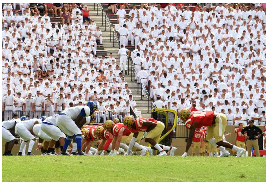
The Keydets face Mars Hill in Foster Stadium Sept. 7.

As the football season continues, visit vmikeydets.com for updates on the team's progress. ❁