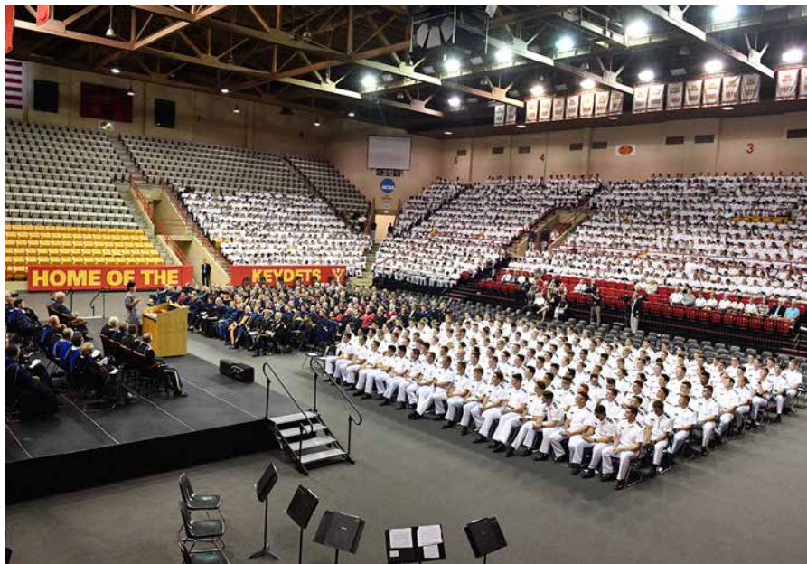
Cadets, faculty, staff, and members of the community attend Academic Convocation in Cameron Hall Sept. 4.

"With this kind of advance comes tremendous responsibility," she commented, adding that loneliness and anxiety seem to be increasing as technology accelerates, as do