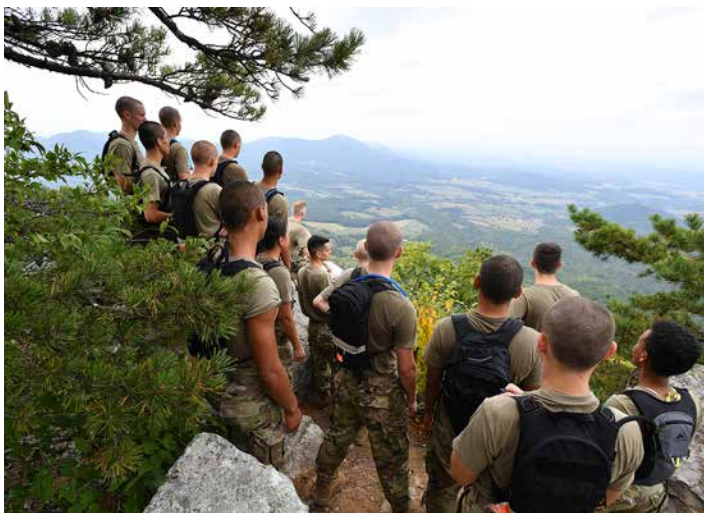
Company G rats take in the view from the top of Little House Mountain Sept. 5.

Maintaining the mountain keeps cadets in shape and strengthens VMI's relationship with the community, ensuring that future generations of cadets see the view from the top of the mountain they look at every day. 🌲