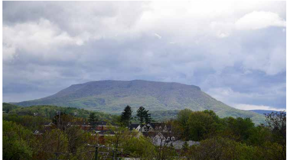
House Mountain consists of two peaks; Little House can be seen from the VMI Parade Ground.

"I am glad that we are able to do House Mountain over Brushy Hills because I