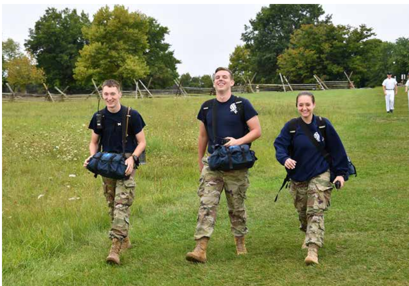
Cadet EMTs attend every major event hosted by VMI, including Oath Day at New Market.