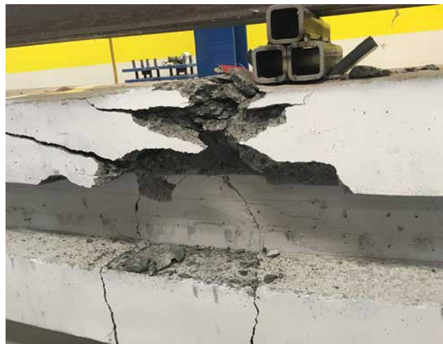
The 20-foot concrete beam cracked all the way through when the weight reached over 32,000 pounds.