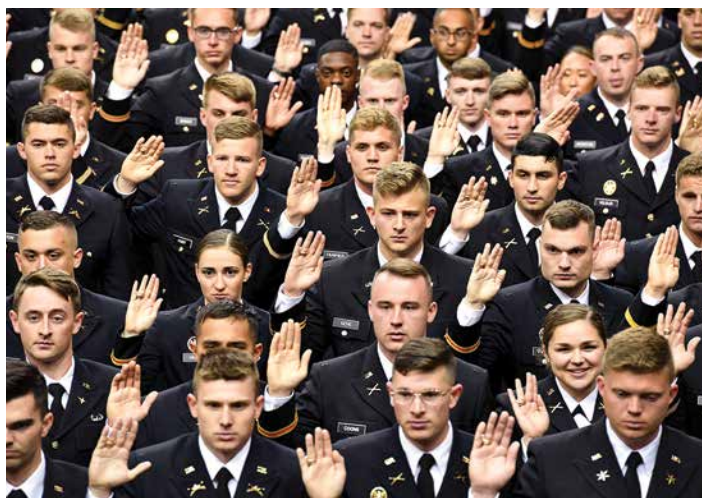
Army ROTC cadets take their commissioning oath in Cameron Hall May 15.