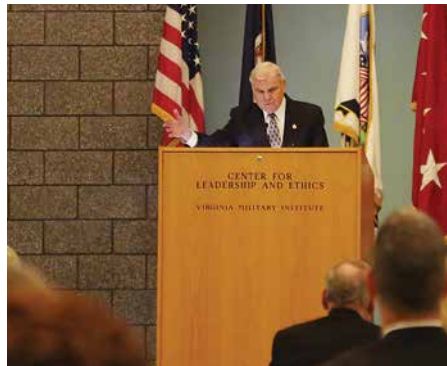
Gen. J.H. Binford Peay III '62 speaks at the board dinner May 3.