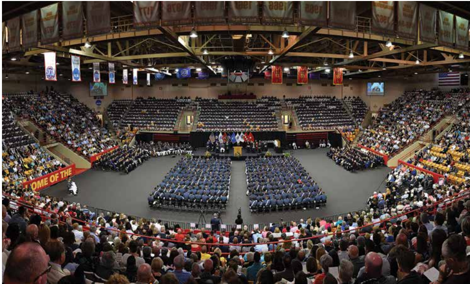
Friends and family fill Cameron Hall to watch the Class of 2019 graduate May 16.

And there are always your brother rats. ❀