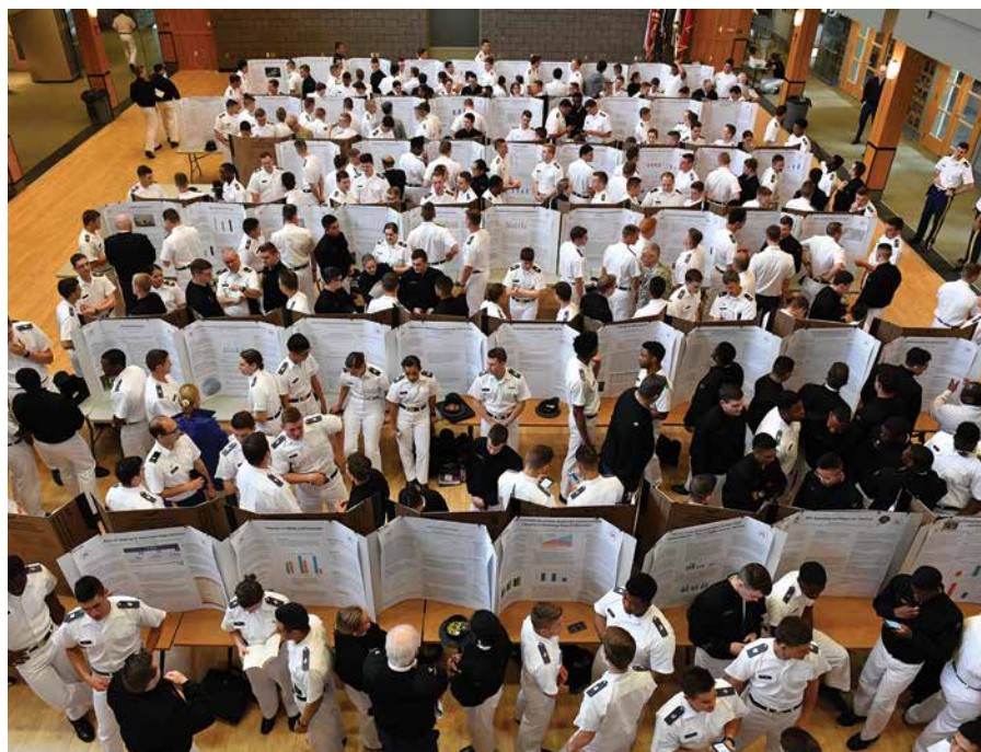
Approximately 230 cadets gathered in the Hall of Valor April 29 to present their Math That Matters research to the wider VMI community.