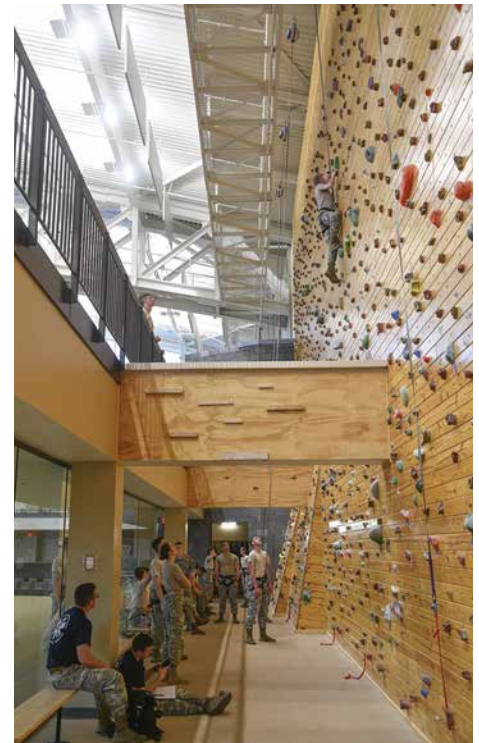
Cadets scale the climbing wall in the Corps Physical Training Facility during North Post Challenge May 1.

Right after the first round of shooting in which cadets rotated and shot from five separate shooting stands, Justin Polito '20 offered a few words.