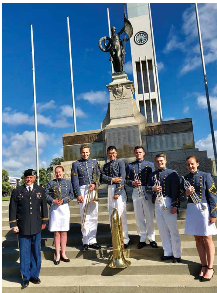
Members of the Institute Brass pause in Palmerston in front of the World War I memorial to New Zealanders killed at Gallipoli.

At the concerts, attendance would often start out quite small but the numbers would grow quickly as the music drew people in,