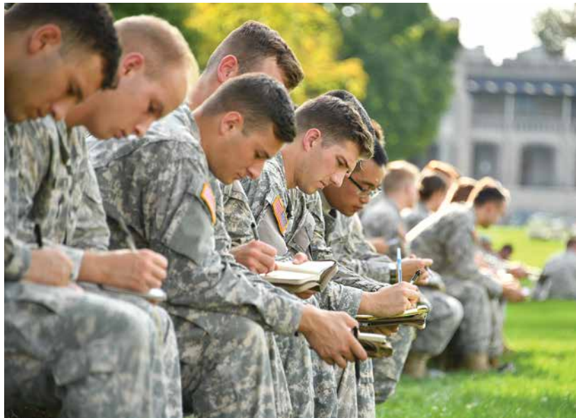
Army ROTC cadets prepare for FTX earlier this fall.

The VMI unit represents the U.S. Army Cadet Command's 1 st Brigade, which consists of the nation's six senior military colleges and five of the military junior colleges.