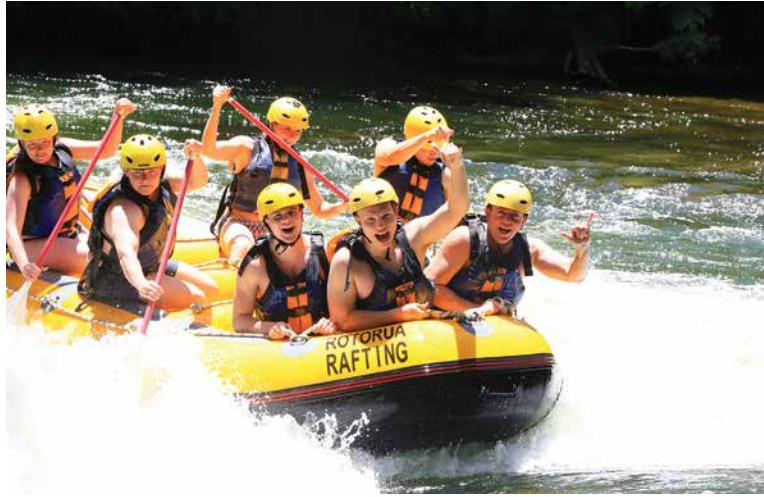
Cadets enjoy a whitewater rafting excursion down the Kaituna River that included a plunge over the river’s famed 23-foot waterfall.

The group has to negotiate where to go next and what to play at the next concert, plus who will introduce the band at the next gig, she explained.