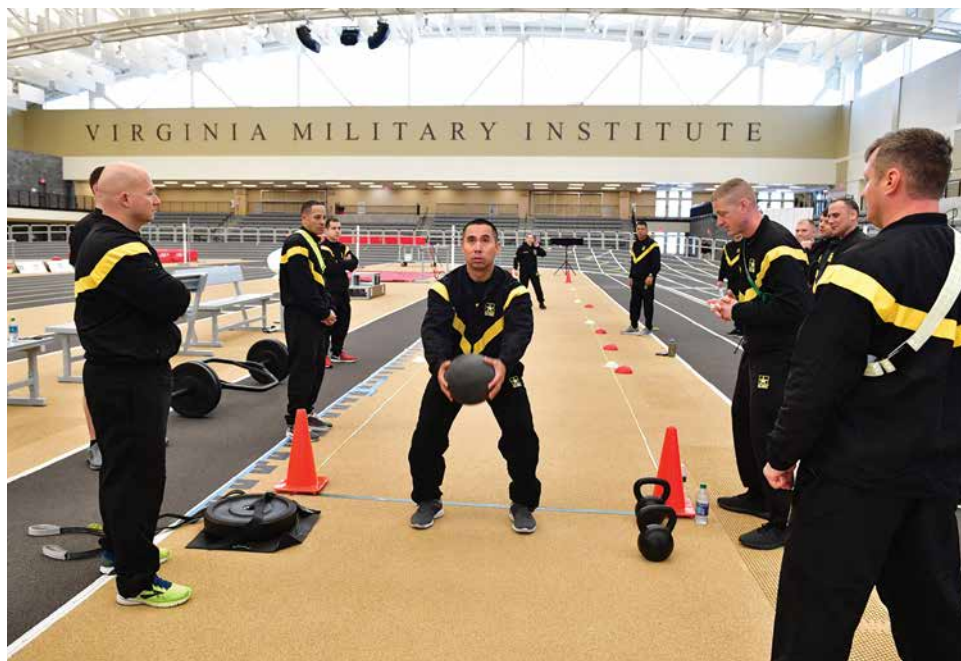
Participants learn the standing power throw, in which they throw a 10-pound medicine ball as far as possible.

As one of the final parts of the refining process towards making the ACFT official, the Army has chosen select test groups from a wide range of units within its structure. This includes everyone in the Army from special forces to administrative units. Included too in the test group are ROTC members, and in December VMI had the chance to play an important role in fielding the new test.