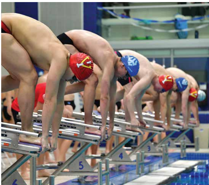
Keydet swimmers face off against the Washington and Lee University Generals Jan. 19 in the Washington and Lee Natatorium.