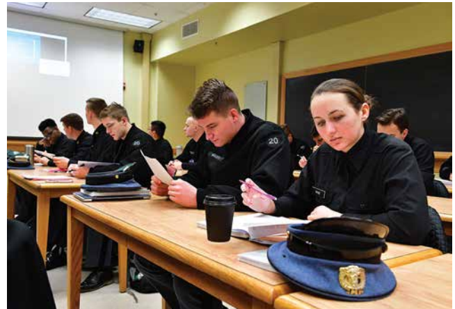
VMI's rigorous academic program prepares graduates for success in all walks of life.

"Its curriculum is designed to give its 1,700 cadets broad exposure to the liberal arts," stated the author. "Cadets take courses in subjects like modern languages, international studies and computer science alongside ROTC."