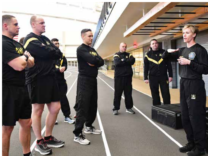
ACFT instructors and future test administrators go over proper execution of the pull-up portion of the test.

"This spring and this fall is going to be an exciting time," added Lindsey. 🍀