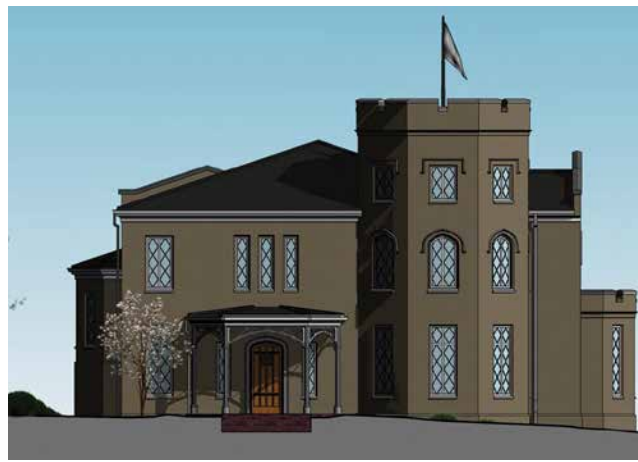
This rendering depicts the building that will replace the current Bachelor Officers’ Quarters, home of the Post Police.

A new facility, designed to match the historic faculty houses on officer’s row, will be built on the site of the Bachelor Officers’ Quarters. While demolition and construction are ongoing, the police department will be housed in trailers on the gravel lot across Main Street, immediately adjacent to the Corps Physical Training Facility.