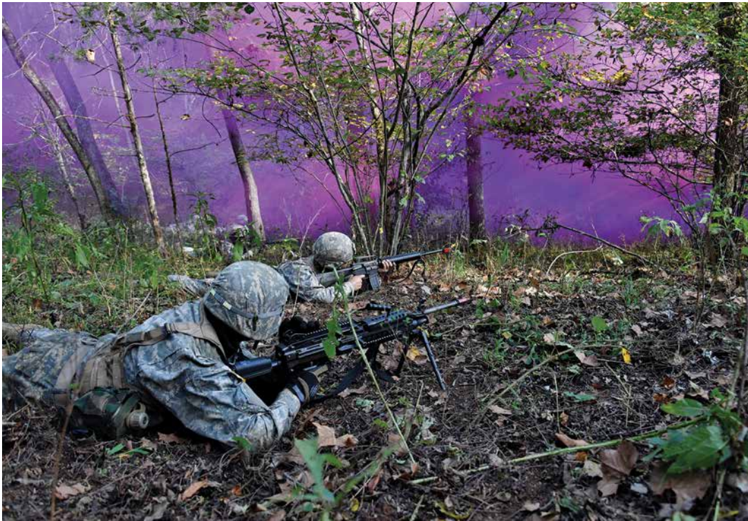
Army ROTC cadets train at McKethan Park during fall FTX Oct. 6.

Fall Field Training Exercises are a chance for cadets to spend extra time on military training as well as experience an immersive leadership challenge. More than 1,000 cadets spread out over post and at McKethan Park Oct. 5-7 to hone their tactical skills and even to play some paintball.