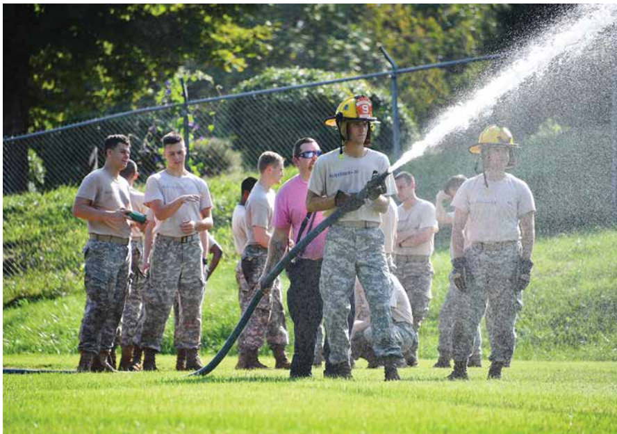
Naval ROTC cadets learn firefighting techniques from members of the Lexington Fire Department on Fiorini Field Oct. 6.

“It's good practice for when we get into the Army. I think this is the most pertinent