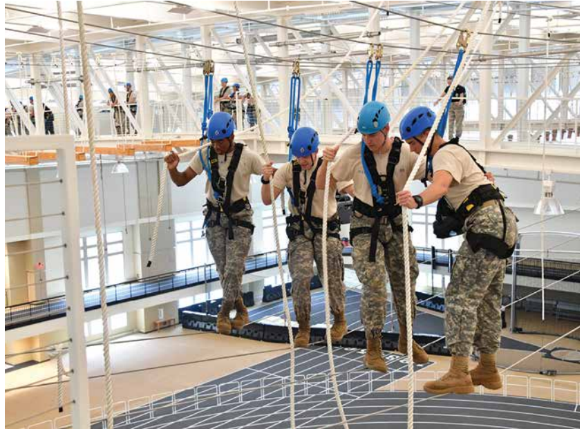
Naval ROTC cadets climb the high ropes course in the Corps Physical Training Facility during fall FTX.

exercises with drills on the Parade Ground followed by rounds of paintball at McKethan Park to learn tactical training. They wrapped up the day with company sports back on the Parade Ground. ❧