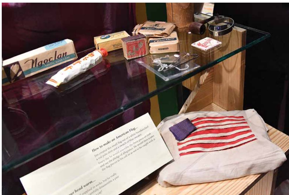
The pieces of cloth Jim Berger '61 used to assemble an American flag are on display in the VMI museum, along with other items from his imprisonment in North Vietnam.

Other objects, like the flight helmet worn by Mike Bissell '61, reflect extraordinary acts of courage.