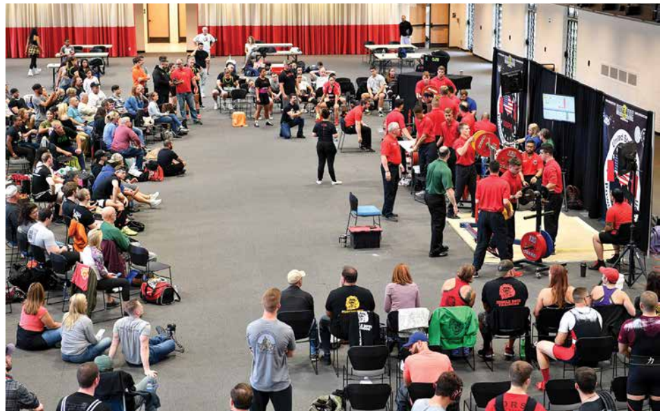
VMI Powerlifting hosts a meet in Cocke Hall Oct. 13.