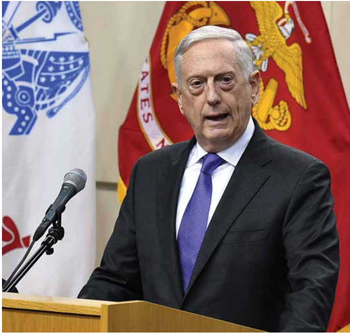
Secretary of Defense Jim Mattis addresses the Corps of Cadets in Cameron Hall Sept. 25.

In addition to elaborating on policy and strategy details, Mattis drew a personal connection with members of the Corps, referring to them throughout the address as, “my fine young cadets,” and offering advice on how to engage with their subordinates after commissioning.