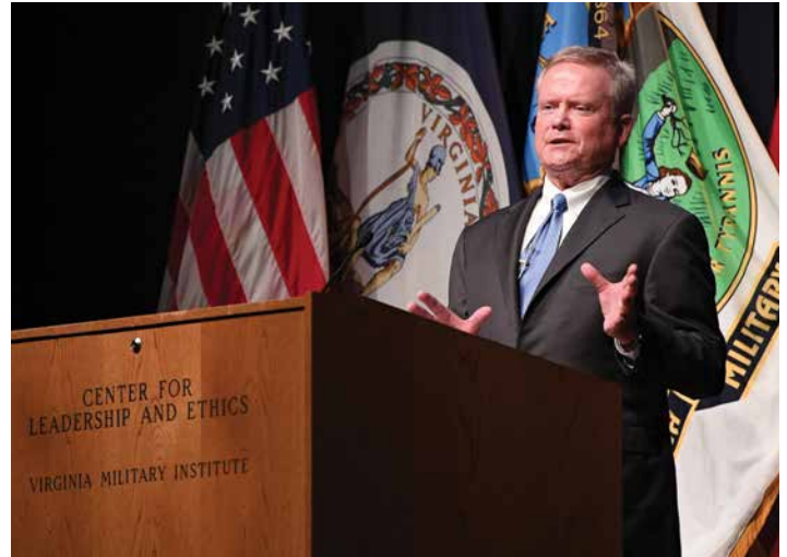
Former U.S. Senator Jim Webb shares his experiences in Vietnam during the Vietnam conference in Gillis Theater, Sept. 24.

Yet the war in Vietnam, which was dramatically unpopular for so many