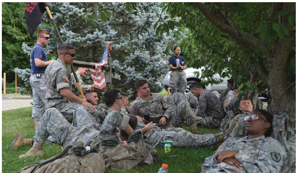
Cadets take a break near Greenville on the second day of their march to New Market.