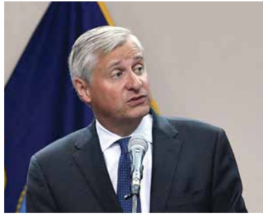
Presidential historian Jon Meacham speaks at Academic Convocation in Cameron Hall Sept. 5.

He elaborated on characteristics of good presidents from curiosity to candor and the humility to ask for help. Specifically, he noted John F. Kennedy's call to former President Dwight D. Eisenhower for advice and to learn from his mistakes after the