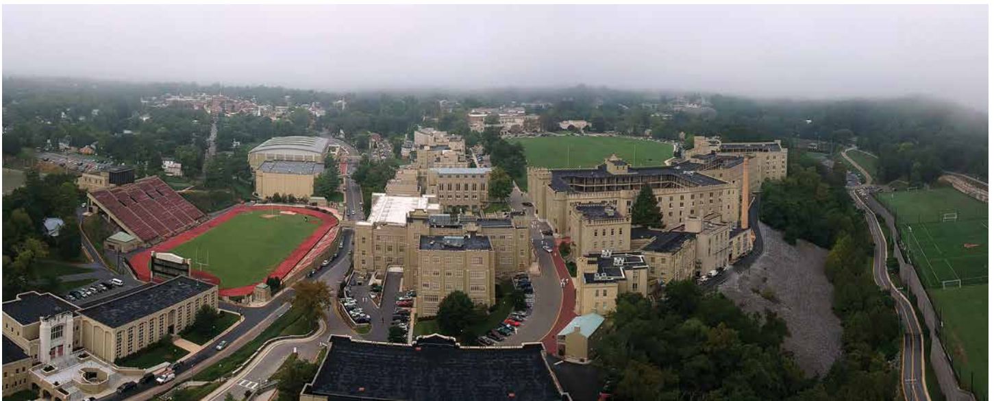
VMI's post is home to a rigorous academic program and rewarding extracurricular activities.

Additionally, the Institute is ranked 31 st in the best bang for the buck, southeast, category. Other Virginia schools in that category were W&L, 1 st ; Mary Baldwin University, 20 th ; James Madison University, 23 rd ; Bluefield College, 27 th ; and the University of Richmond, 28 th . 🌿