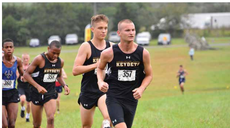
Members of the men's cross country team race at the New Market Battlefield during the James Madison University Invitational Sept. 8.

Both the men's and women's cross country teams turned in sterling efforts at the JMU Invitational Sept. 8 in New Market. The men placed second in the 8K race, while the women took third in their 5K competition.