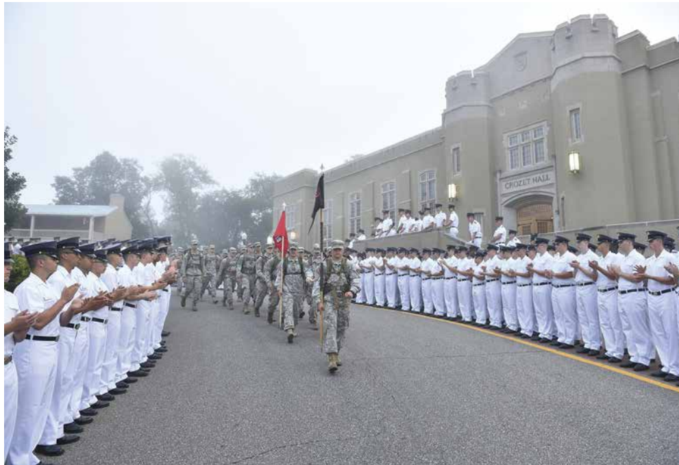
The rat mass forms a cordon as the New Market marchers leave post Aug. 29.