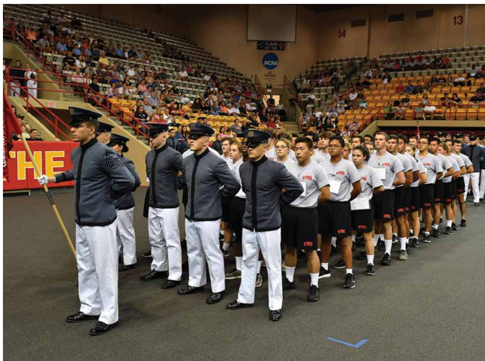
New Company E cadets fall in line for the first time on the floor of Cameron Hall just after the Matriculation Day welcome ceremony Aug. 18.

Most of those going through the process Saturday were enduring the same feelings, as well as the