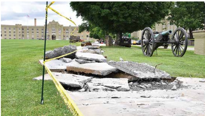
Old sidewalk is demolished to make way for fresh concrete.

Finally, a whole-house renovation of 450 Institute Hill—commonly known as the chaplain's quarters—was completed in August. New plumbing, electrical, and HVAC systems were installed and the kitchens and bathrooms received a complete renovation with new cabinets, fixtures, and appliances. Exterior repairs were made to the windows, roofing, and masonry, followed by a new coat of paint. ❁