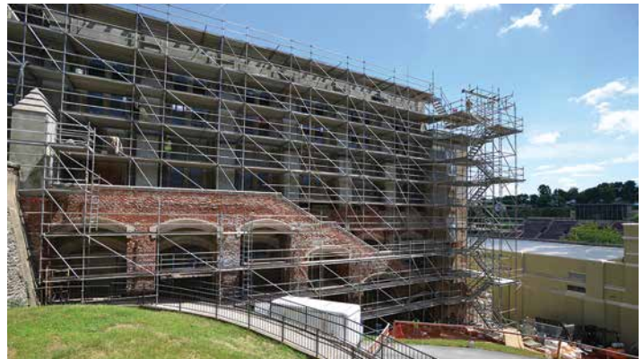
Underlying brick is exposed on Jackson Memorial Hall as new stucco is applied.