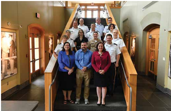
Representatives of SCHEV pose with VMI personnel during their June 26 meeting.

If funds are approved by the General Assembly, detailed planning will begin for the Corps Physical Training Facility Phase III, an aquatic center that will replace the nearly 50-year-old, leak-prone pool in Clark King Hall. The total budget for the project is just