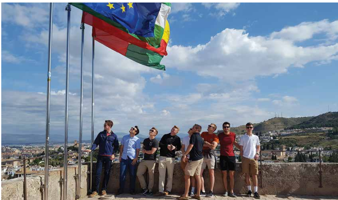
Cadets take in the view from the Alhambra—a palace located in Granada, Spain—during the study abroad trip there this summer.

"I noticed while learning French in France the second time it came much easier to me because of all the work I put in at VMI," he said. "I noticed that I was able to