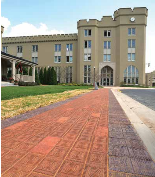
New bricks are laid alongside those salvaged from the existing walkway along Faculty Row.

Across Letcher Avenue, work began on Jackson Memorial Hall in May to