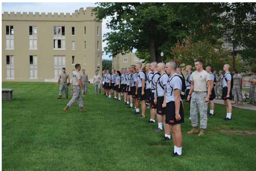
New cadets line up on the Parade Ground to begin training for the Rat Line.

Chief among those is the sheer numbers they brought. This was the biggest class ever to matriculate to VMI, and included were 87 women, the largest number to matriculate in an incoming class to date. The group included 11 foreign students from five different countries, and 104 members of the class were recruited to