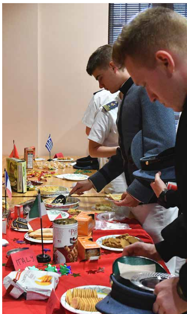
Cadets dine on multicultural food during Modern Language Poetry Night in the Turman Room of the Preston Library April 25.

"The world our graduates will live and work in is becoming increasingly interconnected, and one could argue, increasingly interdependent. Therefore, it behooves us as an institution of higher education to ensure they are prepared for the challenges that come with that environment," Hall said. ❁