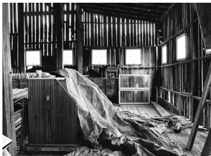
Sunlight creates interesting patterns in an old barn in one of Carlee Anderson’s photographs for her SURI project.