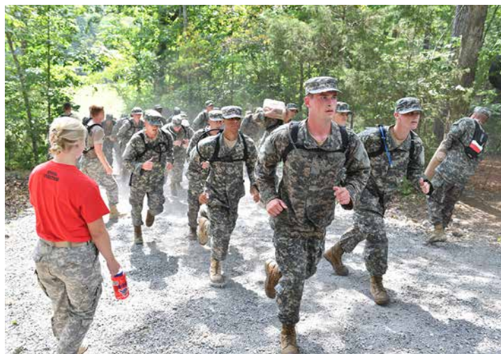
Rats charge a hill on North Post during Rat Crucible, one of the most physically demanding days of Matriculation Week.

On average, the participants burned about 4,500 calories daily over the eight days following Matriculation and an average of 6,500 calories on the three toughest days. Despite consuming about 3,700 calories on average, they were still burning more than they were eating. That imbalance was lessened as the semester went on.