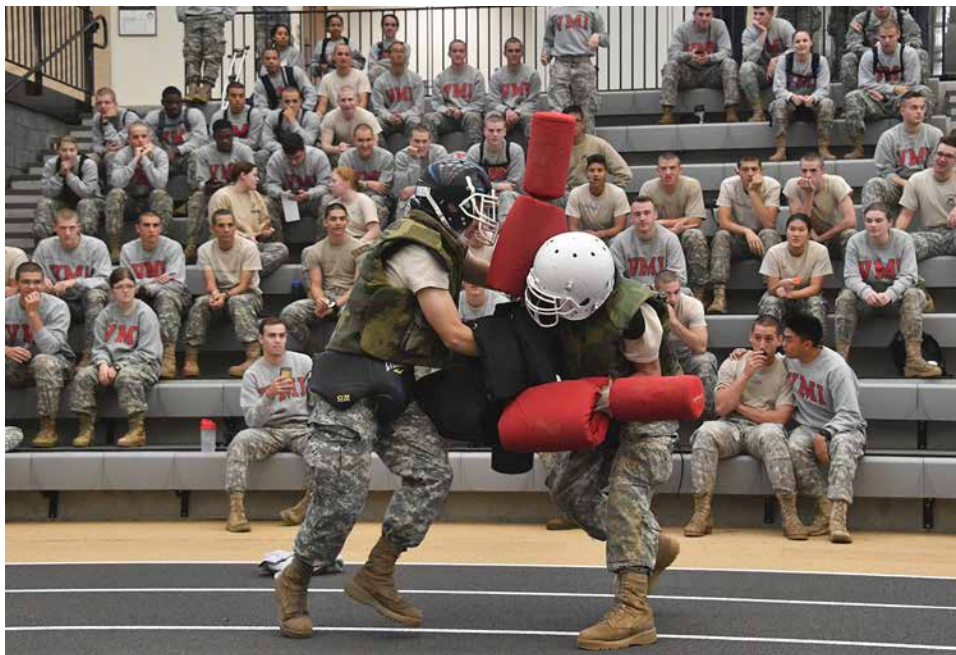
Rats wear helmets to prevent concussions while fighting with pugil sticks during Rat Olympics—a physical education department event held in the fall.

Cadets who lose consciousness as a result of a concussion are taken to Carillion Stonewall Jackson Hospital for a CAT scan. For the vast majority who do not lose