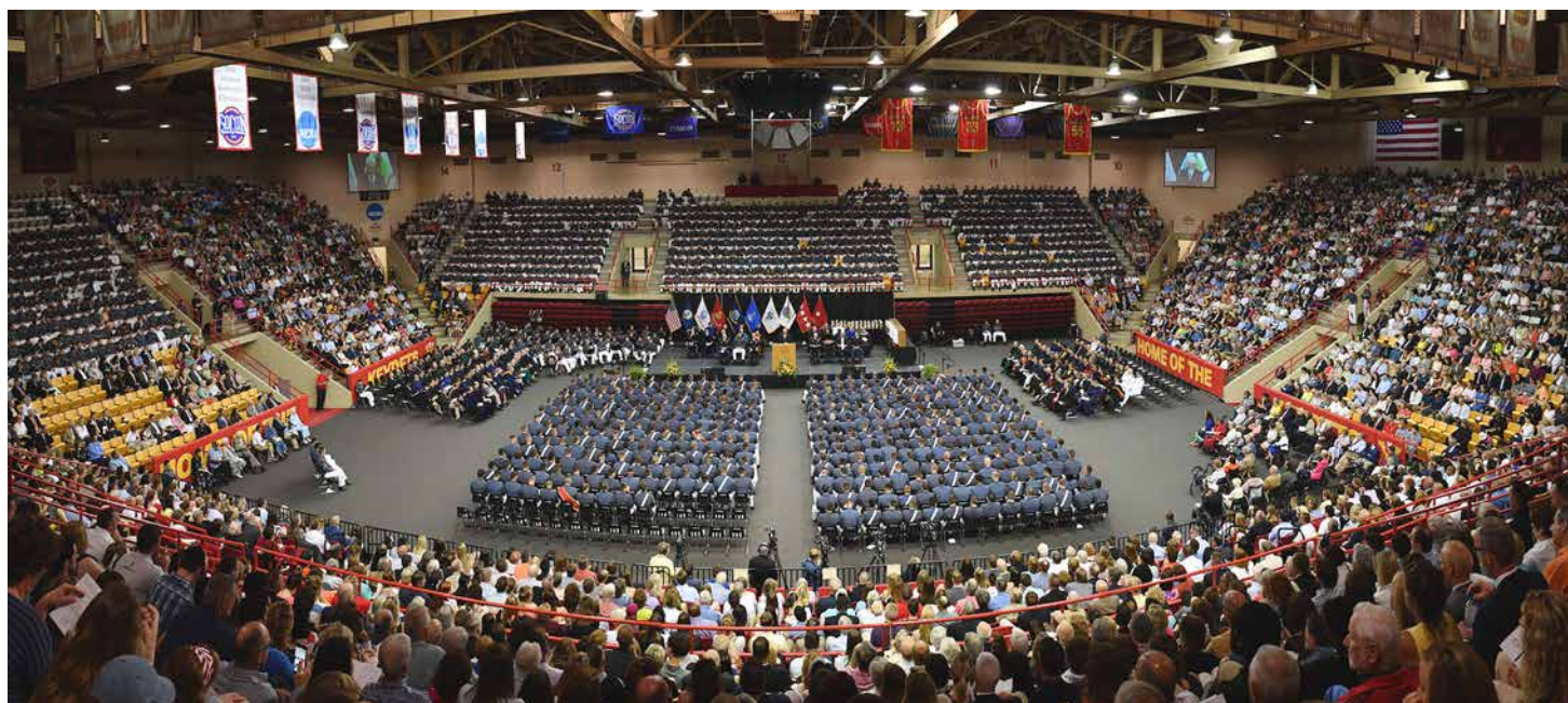
Cameron Hall is filled to near capacity to watch 373 cadets graduate May 16.