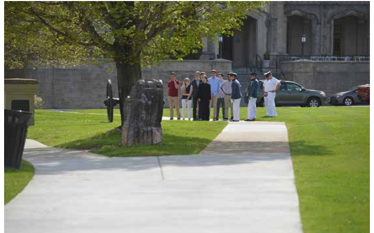
High school students receive a tour of VMI upon arriving for the Model UN conference on April 28.

To start, they were to envision a conflict between India and Pakistan in Kashmir in 2025. Minerals were found in the state that could be used for weapons, technologies, and