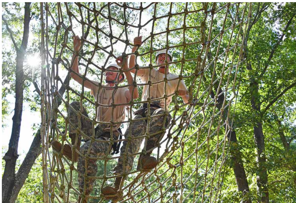
Rats wear safety gear, including helmets, while climbing the high ropes course during Rat Challenge this fall.