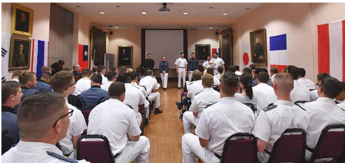
Cadets participate in Modern Language Poetry Night in Preston Library April 25.