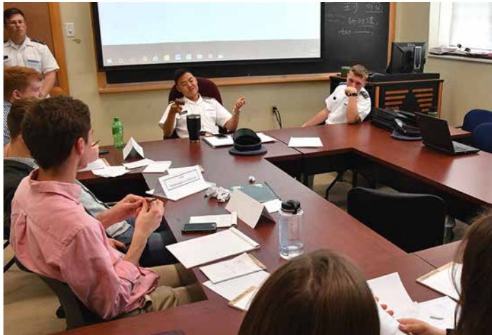
Area high school students participate in Model UN hosted by VMI's Model UN club in Scott Shipp Hall April 28.

computers. Terrorist attacks and diplomatic challenges followed.