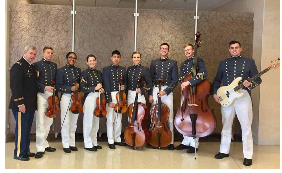
Members of the string ensemble played at the Fort Belvoir Community Hospital in December.

Now, with a larger and more well-established group, the string ensemble is busier than ever. The group has performed for the Board of Visitors twice. and once for the Southern Military February 2018