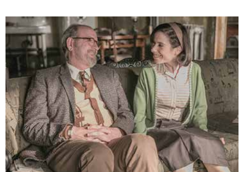
The "VMI Spirit" plays on a television in the background of this scene from The Shape of Water with Richard Jenkins and Sally Hawkins.