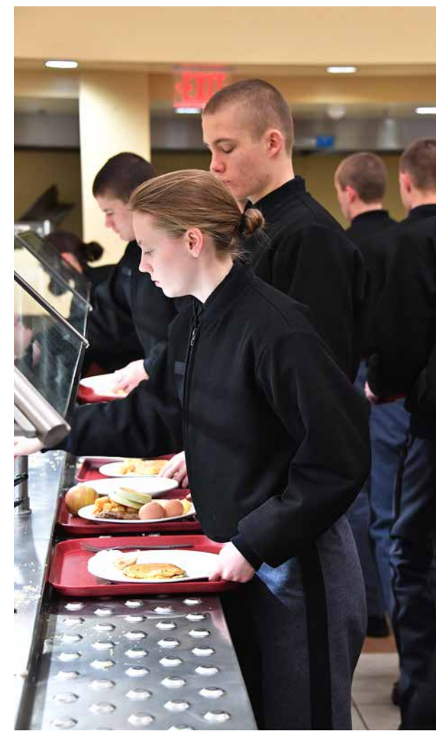
Cadets choose breakfast items in Crozet Hall Jan. 31.

Local restaurants will be given chances to partner with dining services. The Southern Inn restaurant and