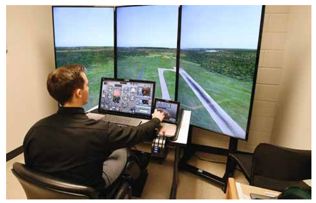
Air Force ROTC cadet Phillip Meyer '18 sets the location and the weather conditions on the flight simulator located in Kilbourne Hall.

A cadet is selected each semester to be responsible for the simulator, to help new people try the simulator, and to create special training plans.