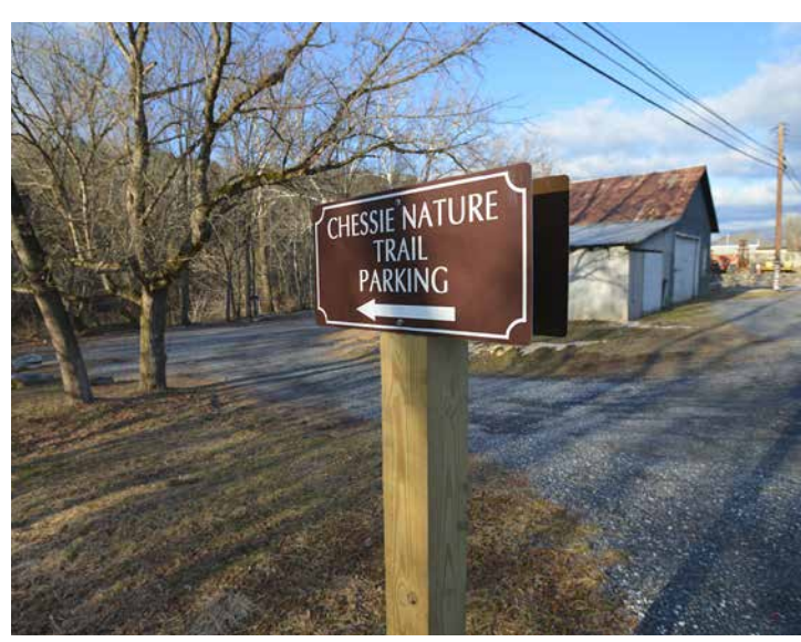
A sign indicates the parking area and current entrance to the Chessie Nature Trail.

"We think it will be attractive to folks to go from Buena Vista to Lexington," said post engineer