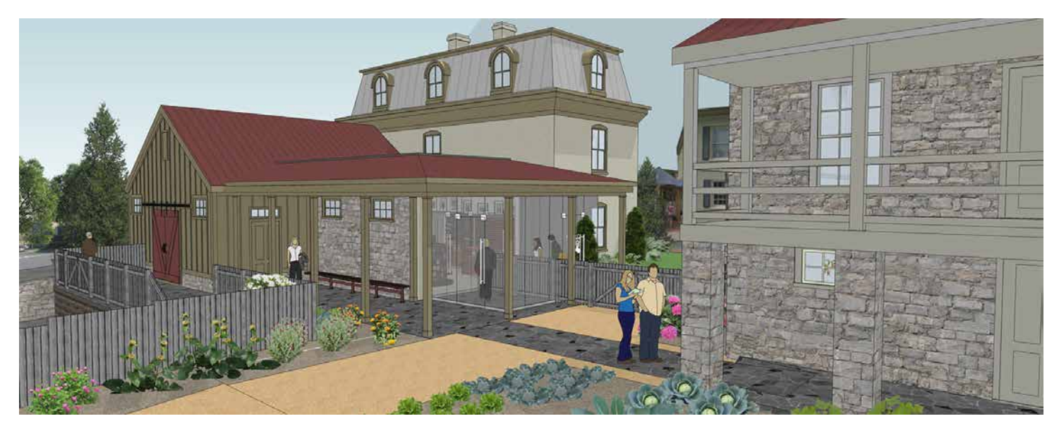
This artistic rendering shows the Davidson-Tucker House additions from the Stonewall Jackson House garden.

There's another change coming, too, to the orientation room. Entrance to the orientation room will be free, so visitors who are only mildly interested in Jackson or have little knowledge of him can