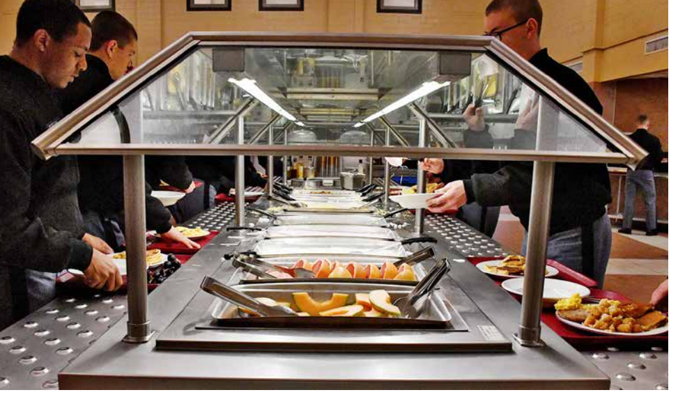
Parkhurst Dining Services offer cadets a variety of breakfast choices in Crozet Hall.

For the PX, Parkhurst plans to change up the offerings and create a larger variety of VMI Institute Report