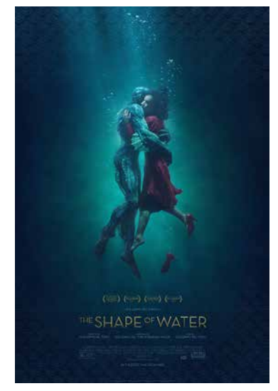
The Academy Awards nominated move The Shape of Water features a scene with the "VMI Spirit" playing in the background.

"I find it interesting that VMI found its way into an Oscarnominated film via a 60-year-old