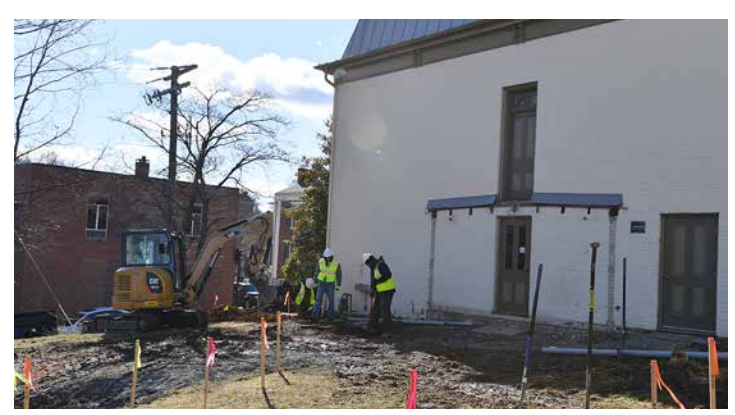
Construction begins on the Davidson Tucker House as crews remove a patio and concrete walkway.