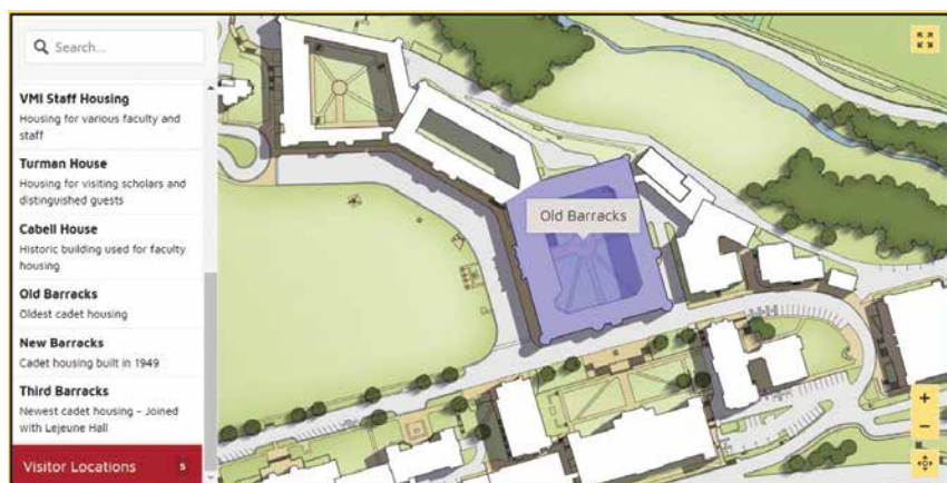
A screenshot shows an interactive post map designed by Brian Colitti '17 and Marc Howe '17. The map is now available to the public on VMI's website.

The map is available for public use at map.vmi.edu . ✂