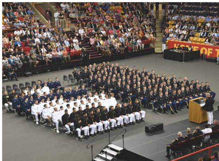
Approximately 160 cadets commission into the military during the joint commissioning ceremony in Cameron Hall on May 15.