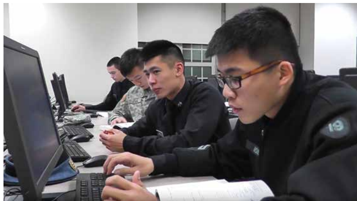
Cadets compete in the Consortium for Mathematics and Its Application's competition.