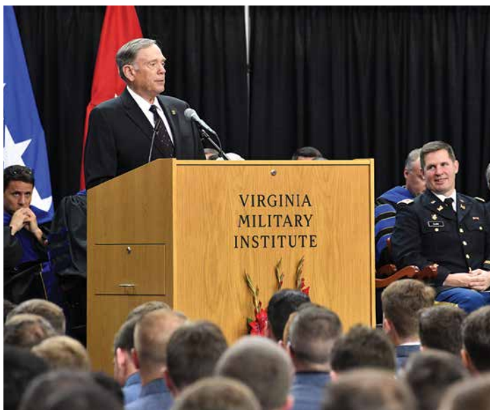
Gen. John P. Jumper '66 addresses the graduates in Cameron Hall on May 16.

With that sentiment in mind, Jumper gave his listeners a brief historical review of the events of World War I and World War II, as well as the American Revolution. He encouraged the graduates to visit sites such as the Normandy beaches where the D-Day invasion occurred, as a sense of history is palpable