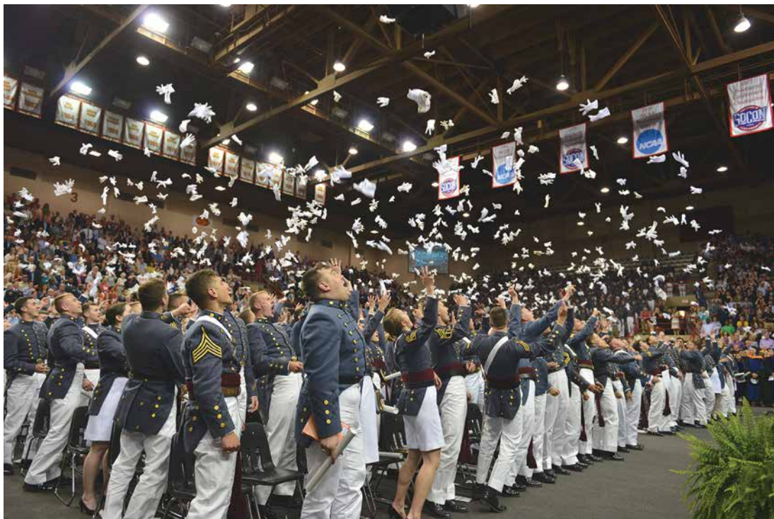
Three-hundred and nineteen cadets toss their gloves in the air after being dismissed from duty during the graduation ceremony in Cameron Hall on May 16.

"I've heard this saying my entire cadetship but I've never really believed it until now: you spend all four years trying as hard as