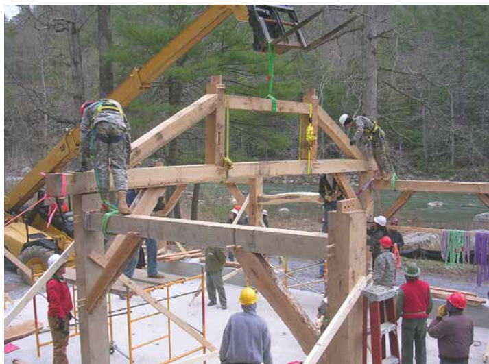
Cadets help assemble a timber frame shelter at Goshen Pass during the spring 2009 FTX project.

Will Hinton be one of them someday? “There is no doubt in my mind,” Hinton said. “No doubt at all.” ❀