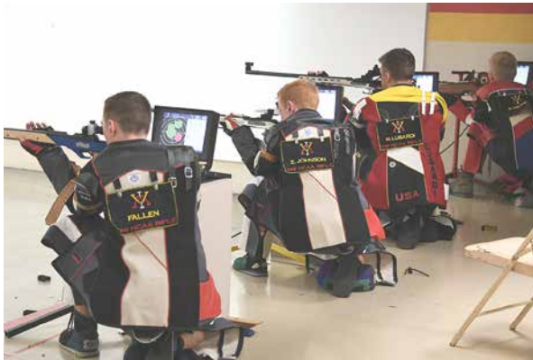
Members of the rifle team pace themselves between shots during a competition against the Citadel earlier this fall.

"We've got some really strong freshman who are returning next year as thirds," he said. "I hope we can continue this roll and have another great year." ❄