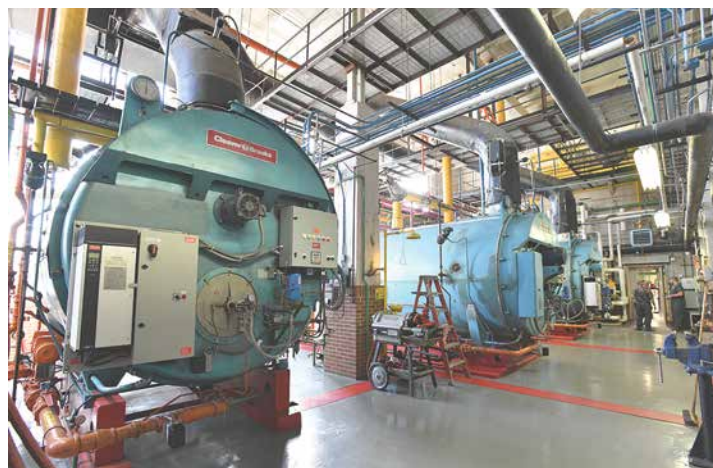
The three boilers in the heat plant create enough steam to heat most of the buildings on post.

The heat plant serves most of VMI including all of the buildings on academic row, barracks, and Crozet Hall. ❄️