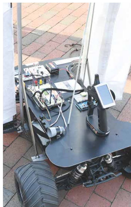
The tick rover features an array of sensors and instruments and is the product of hundreds of hours of work.