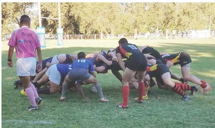
The rugby team competes against the Argentine Naval Academy’s team over spring break.