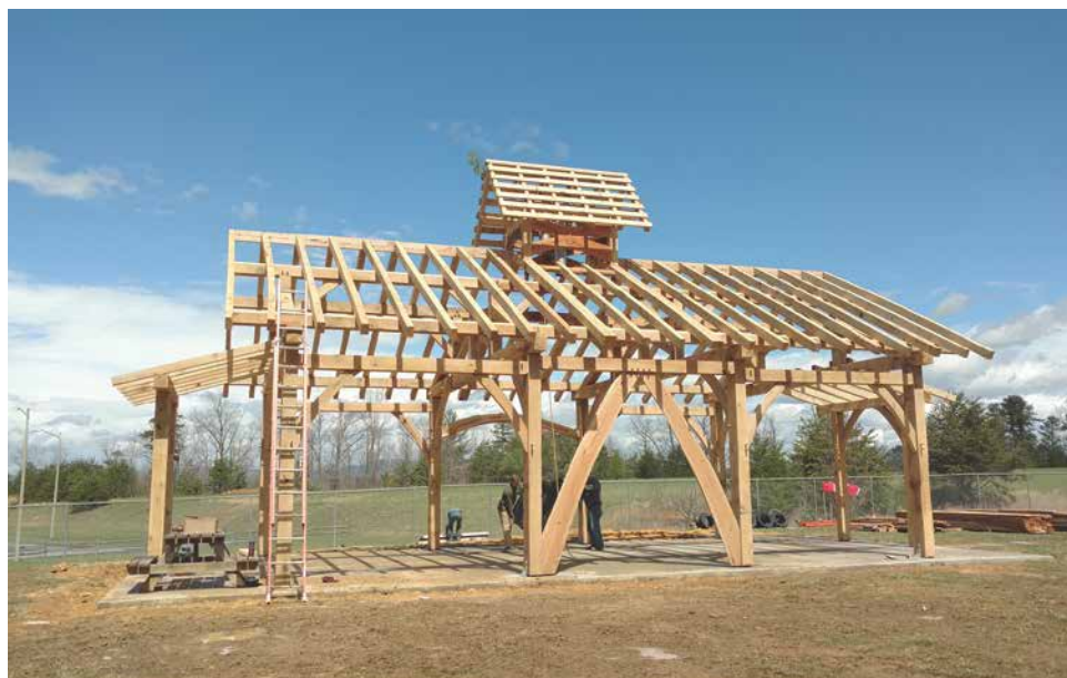
The timber frame of Parry McCluer High School's pavilion stands assembled at its location in Buena Vista.

And while the structures themselves have been important, they're also been a vehicle for teaching life lessons – and connecting with cadets who may be less than well served by the traditional, classroom-based educational system. It's been Mullen's lifelong mission to reach what he calls the "2.0-and-go"