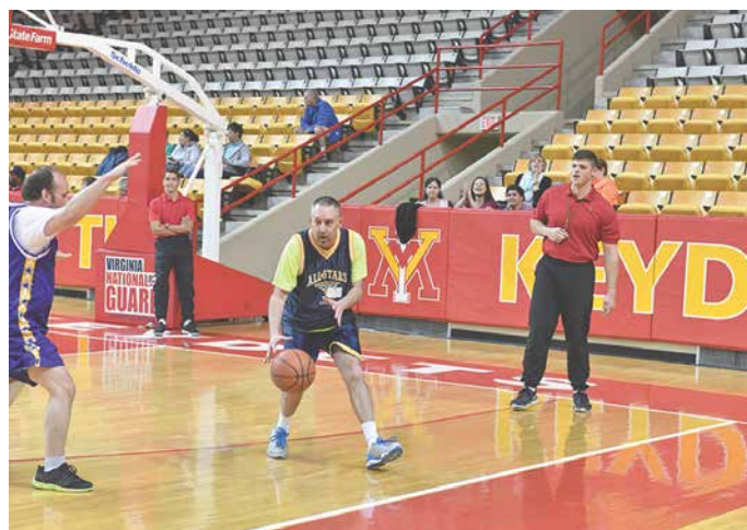
Cadet volunteers referee the basketball tournament held in Cameron Hall during the Special Olympics.