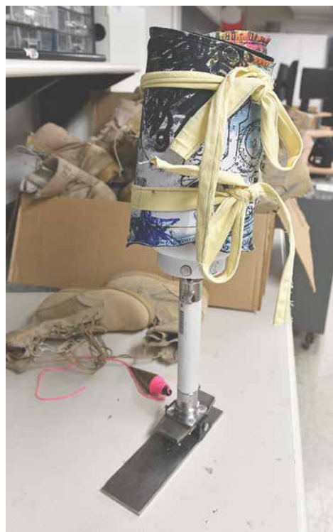
The prosthetic leg is made from low-cost PVC pipe and steel to make it more affordable.

"You want to develop something that's comfortable for the user." 🌱