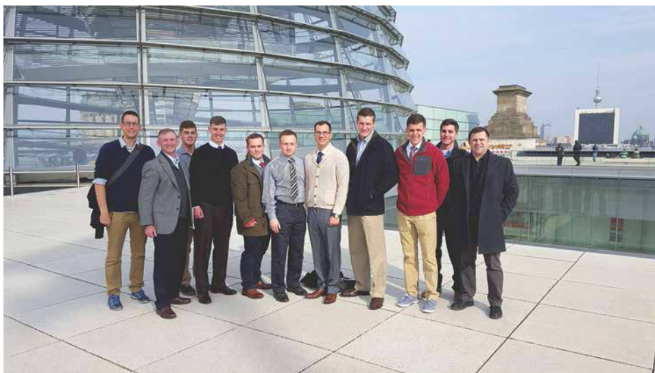
Participants in the Olmsted-sponsored trip to Europe pause at the top of the Reichstag March 13.