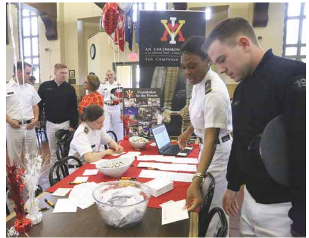
Cadets write notes of thanks to donors during the Foundation's first Thank-a-Giver Day.