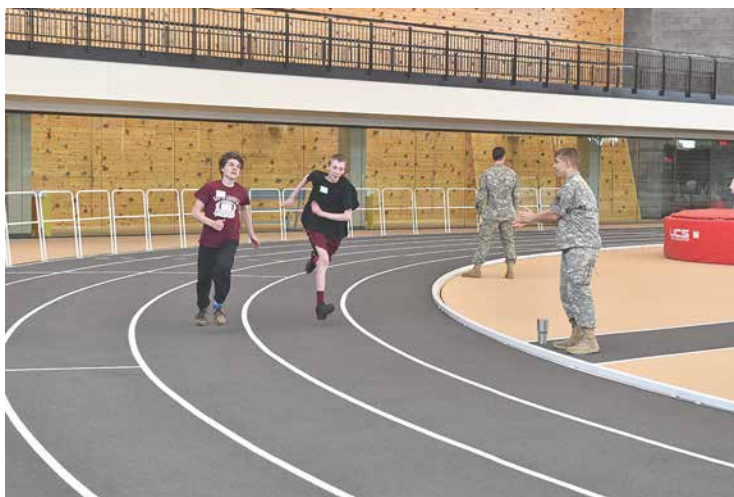
Cadet volunteers cheer on special olympic athletes as they run during the track event in the Corps Physical Training Facility on April 1.