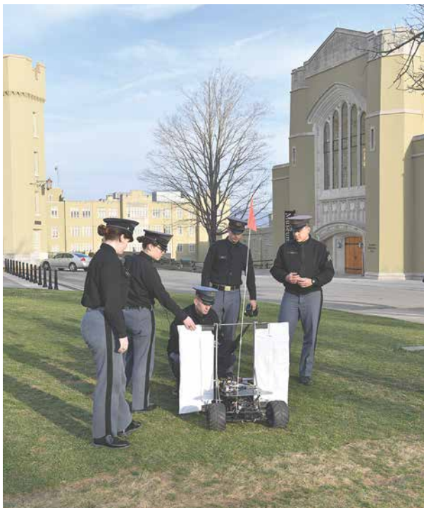
Cadets take the tick rover out on the Parade Ground before sending it to Texas for its first trial run.