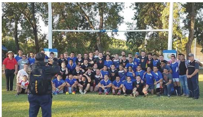
The rugby team pauses for a photo with members of the Argentine Naval Academy’s squad.

young men to grow not only as rugby players but as human beings, and you just can’t put a price on that.” ❀