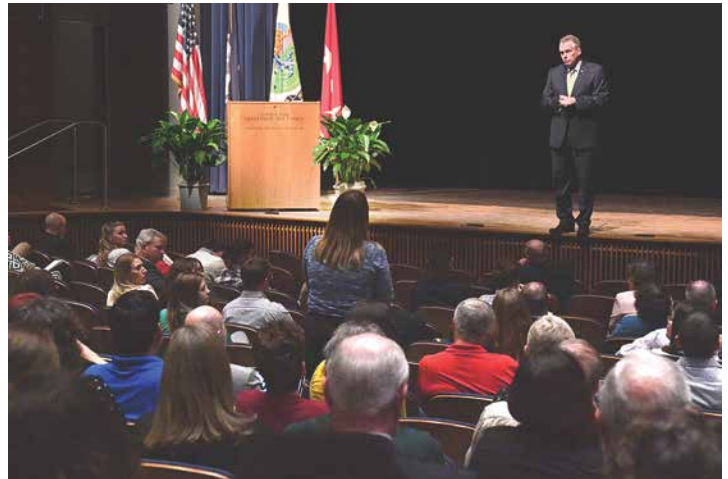
Gov. Terry McAuliffe answers a question from an audience member after his keynote address on April 5.